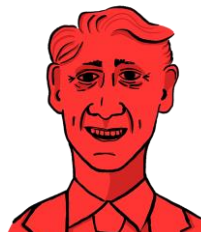
Harvey Milk (USA)