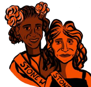
Martha P Johnson and Sylvia Rivera (USA)