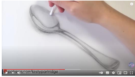
5 Tips for Drawing Realistically | Drawing Advice for Beginners

"How to make your drawing look realistic"