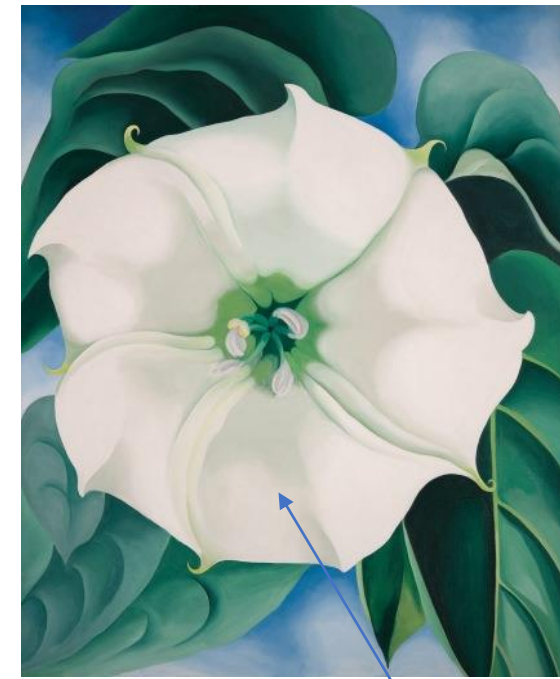
This sold for $44 million!

She decided to be an artist when she was 10