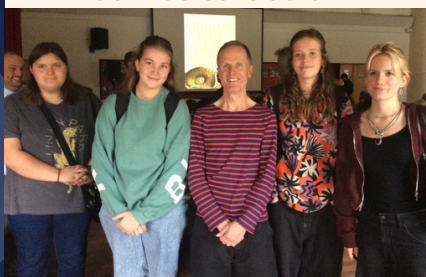
Students lead United Nations Assembly