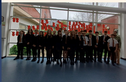
Drama Trip to see Woyzeck